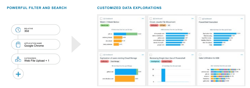
Hunt for potentially risky or out of the ordinary behavior

Our powerful filter and search features help you hunt for threats proactively with custom data explorations. You can search for risky behaviors and activities that apply to your organization or in response to new risks.