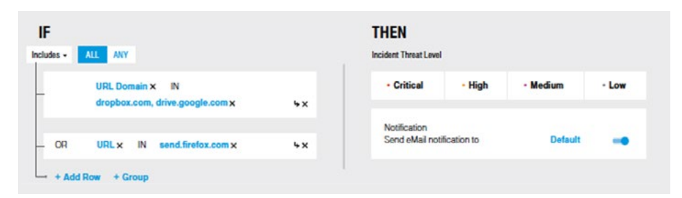
Setting up an alert with simple and flexible if-then statements

You can create rules and triggers tailored to your environment with our Boolean logic-based rules builder. Rules can be created from scratch or on top of our pre-built threat scenarios. Data loss rules can focus on sensitive data movement using Microsoft information protection labels. This reduces alert fatigue compared to anomaly-based detection systems.